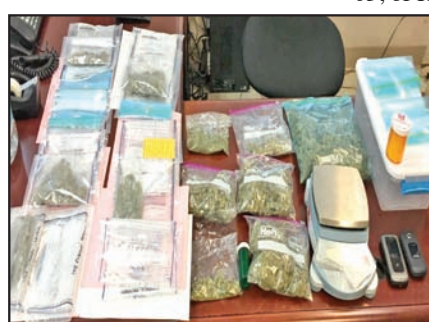
A search warrant executed for a home on Sims Road yielded illegal goods worth over $7,000 in street value, according to the Towns County Sheriff's Office.

The investigation is active and ongoing, and additional charges are likely.